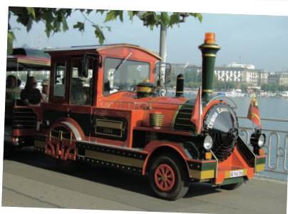
A unique way to travel – try the Tourist locomotive .

Navigation, are provided from ports all around Lake Geneva. Bicycles are another option, with many safe and scenic routes highlighted in the VELO-LOVE Plan de Ville , found at any bike shop in town. Free bikes are available through the "Geneve Roule" scheme kiosks throughout the city.